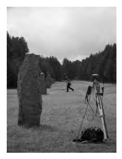
A topographic survey undertaken at Treblinka extermination camp as part of a non-invasive archaeological survey.

to the wealth of information provided by the non-invasive methods, permission was granted to carry out small-scale, confirmatory excavations to determine whether human remains were present. Human remains were observed in all three graves, which contained the bodies of multiple individuals, and the grave measurements were already clear from the LiDAR survey. In all graves the remains were not in anatomical order.