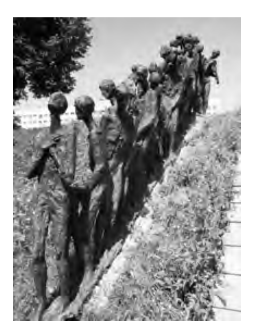
The "Yama" memorial and The memorial for the murdered Jews of Gorodeya (on the opposite page).

rusian president to the "Yama".<sup>4</sup> At the 70<sup>th</sup> anniversary, in October 2013, the Belarusian minister of foreign affairs, Uladsimir Makei, was the main speaker at the official ceremony at the "Yama".<sup>5</sup>