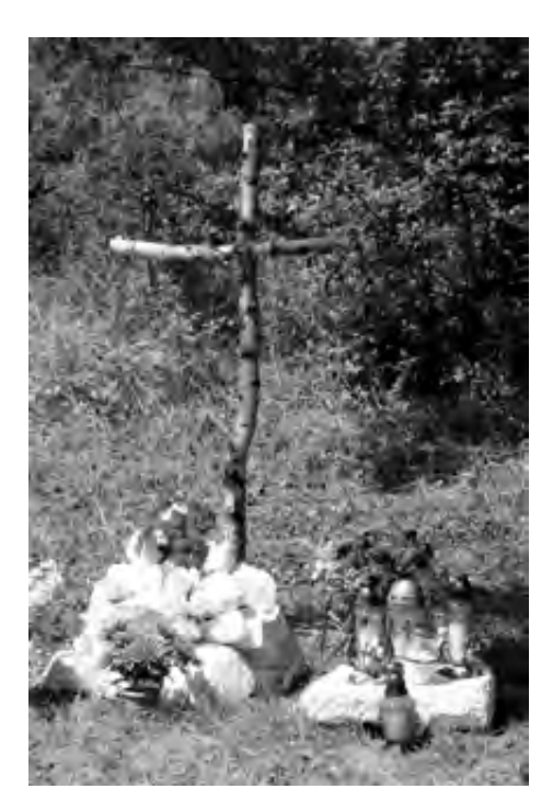
Provisory commemorated site of Roma Genocide, Bielcza, region Małopolska, 2010.

The Caravan Memorial fills in a significant gap in education about the genocide of both Roma and the majority population. Although the extermination of Jewish and Christian Poles is a topic at schools and educational institutions, knowledge about the genocide of Roma is not prevalent and only available to those who seek it.