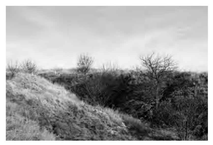
Site of mass graves of Jewish victims in Ladozhskaya (Krasnodar region, Russia).

Moreover, silos are often located on private properties, fields or on industrial territories. How do we deal with this situation?