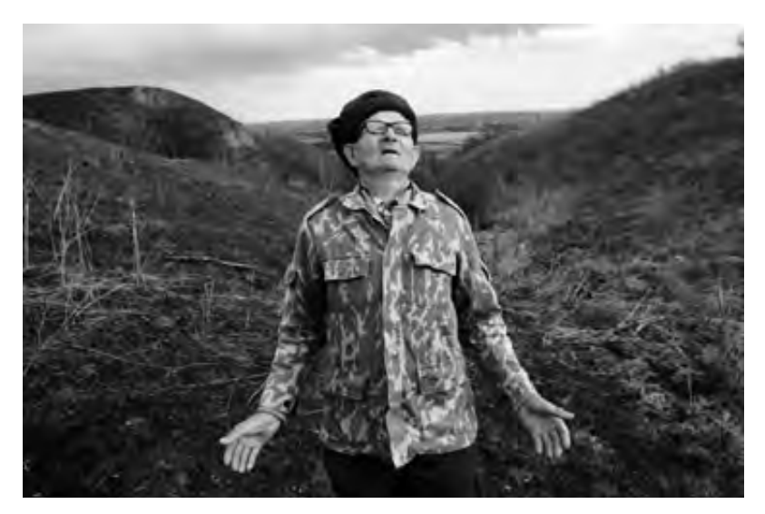
Eyewitness imitating the bodies pose of the victims lying in the ravine (Ladozhskaya, Krasnodar region, Russia).

for one small village and less than 50 pages for a large city. It completely depends on the local people who were in charge of the original inquiry.