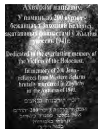
Memorial at Zhylichy.