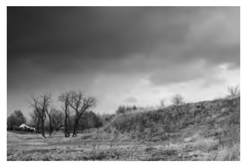
Site of mass graves of Jewish victims in Tuchin (Volhynia region, Ukraine).

Another question, consequently, is where are the bodies that remained on the Killing Site? Moreover, the places are not typically memorialized at all and remain quite challenging to identify.