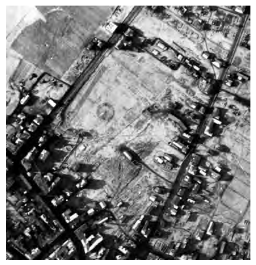
Iv-Frankivsk mass grave at Belvederska Street.