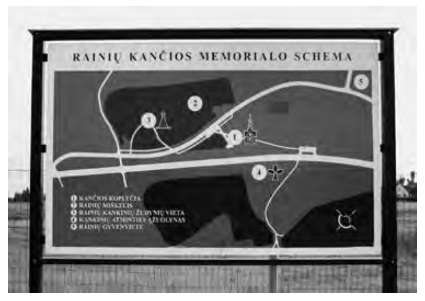
Vilna Gaon State Jewish Museum, 2011.

murder site is still not indicated on the site map nor is it visible from the road. ^{\scriptscriptstyle 5}