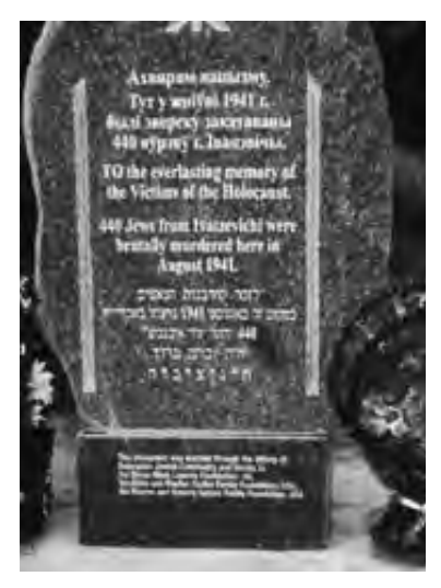
Memorial for the Murdered Jews of Ivatzevichi.