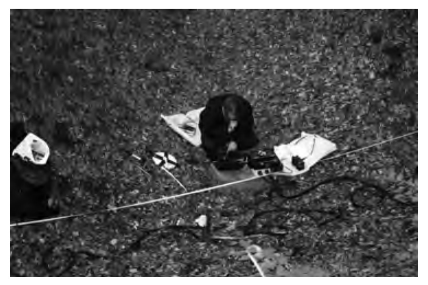
Studying the locations and sizes of the Killing Sites of Holocaust in Bryuchovychy near Lviv.

To resolve the obstacles and complexities our organization was looking for ways to avoid digging at the Killing Sites.