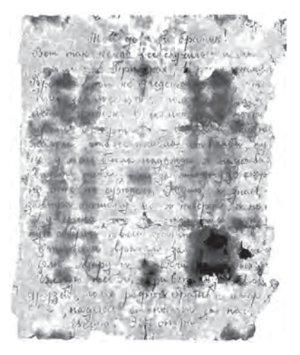
Last letter of Eleonora Parmut from Priluki, Ukraine.