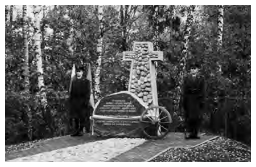
Opening ceremony. Monument of Roma victims. Ułęż, Lublin region, Poland, 2009.