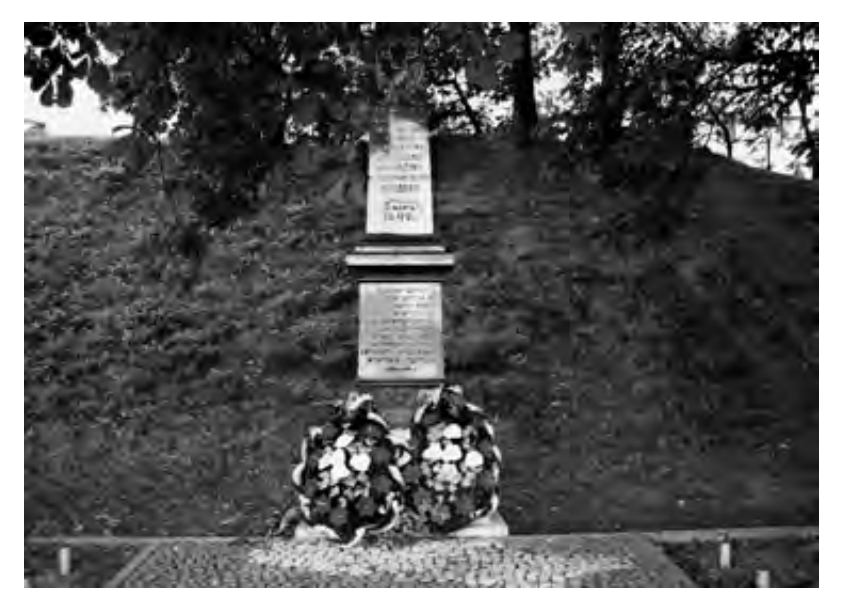
The Obelisque in the Pit.