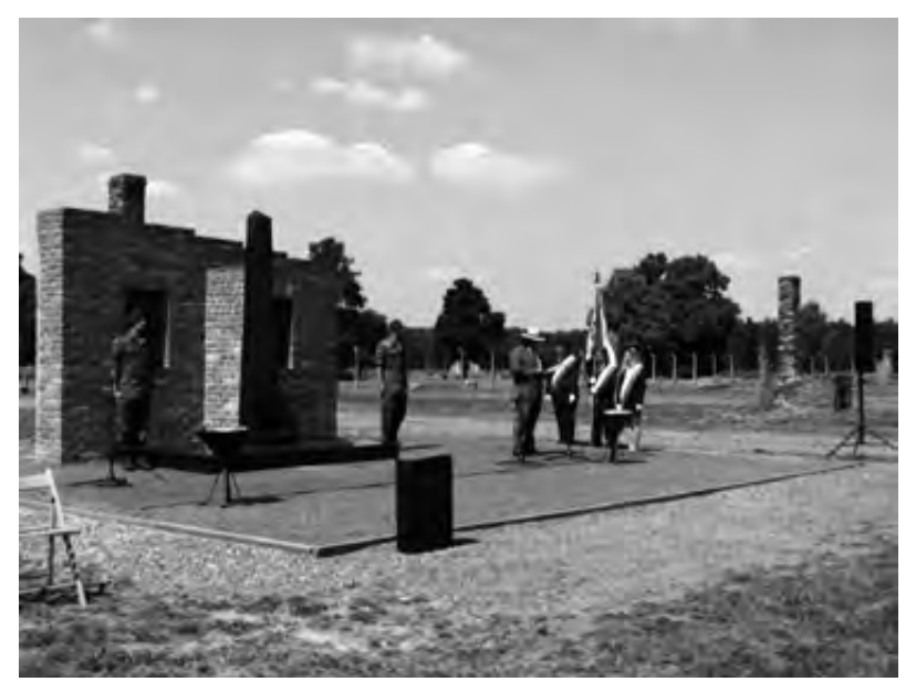
Auschwitz-Birkenau, Remembrance day for the victims of the genocide of the Roma, manifestation of young Roma, 2013.

after and commemorated by local communities even before the project started.