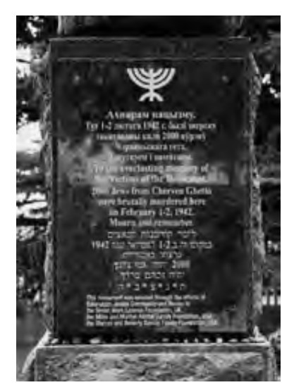
Memorial for the Murdered Jews of the Cherven Ghetto.