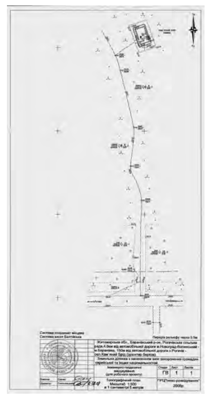
Plan of the area and the mass grave near Kamyany Brid, Zhitomir Region.