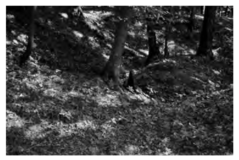
Bryuchovychy – depressed soil of the Killing Site of Holocaust.