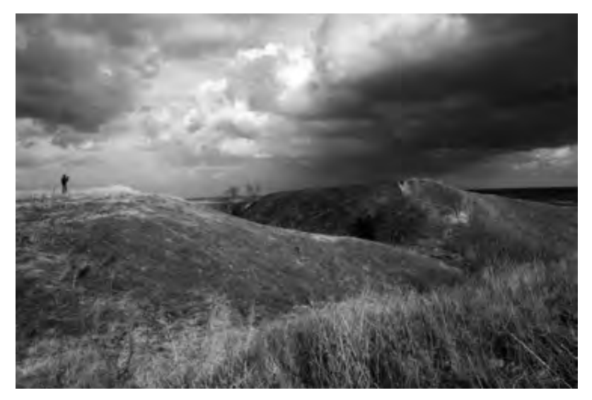
Site of mass graves of Jewish victims in Kolosivka (Mykolaiv region, Ukraine).

lenged Jewish victims identified by Yahad are not protected or commemorated (in Southern Moldova for instance).