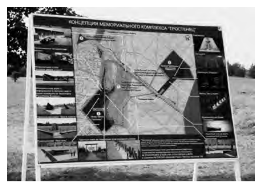
The combined memorial plans at Trostenets.

pean countries as well as Belarusian Jews, members of the partisan resistance movement and other Belarusian citizens were murdered, the future Trostenets memorial site should become a genuine place of joint European remembrance. This intention is also shared by the Belarusian authorities, as President Lukashenko emphasized in his statement at the site in June 2014. But to accomplish this aim, the mere establishment of a memorial site will not suffice.