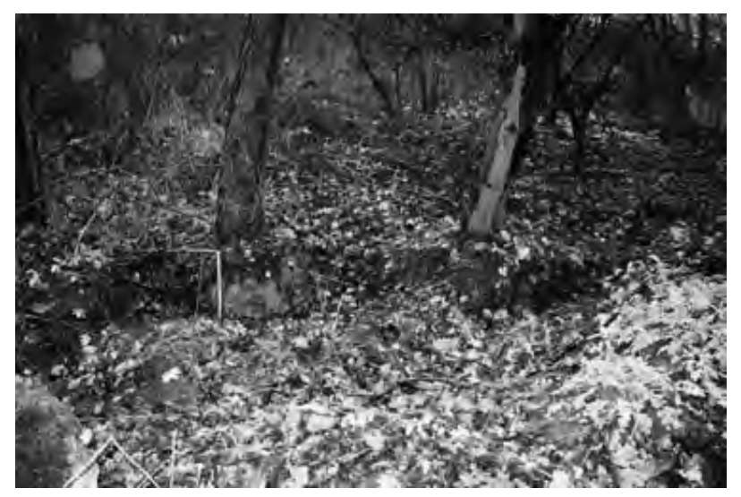
The Killing Site of Bylogorshcha near Lviv.