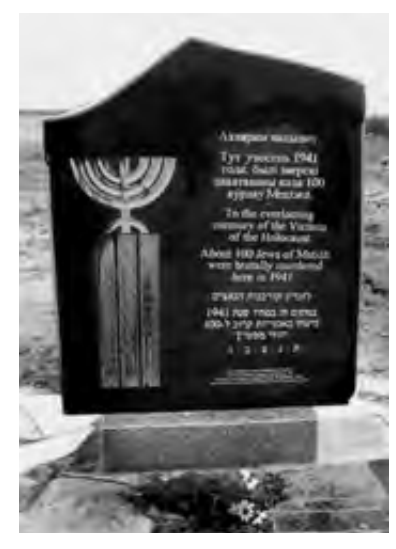
Memorial at Mstizh.