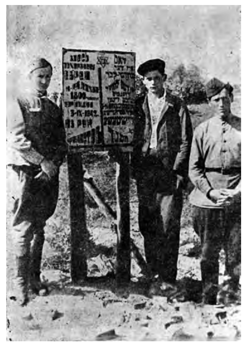
Łachwa, murder site.